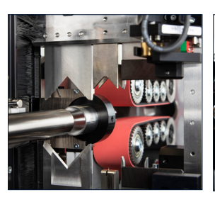
High-precision cutting unit with SmartDetect quality-monitoring system.

The intuitive and standardized user interface of the S.ON software simplifies operation; numerous preset cable applications reduce the programming time. The module-based software supports parallel machine processes.