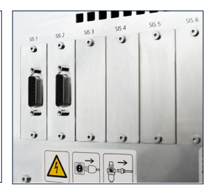
Modular interfaces for an extensive range of accessories and the connection of peripherals.