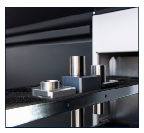
Color-coded guides simplify operation and reduce setup times.