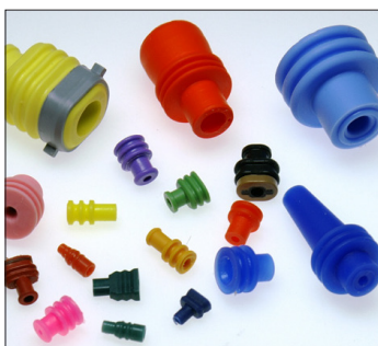
Wide range of seal types